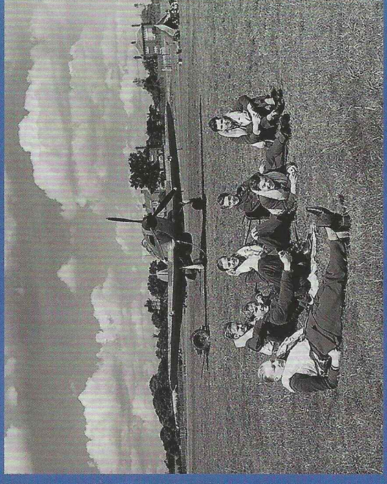
Walk in the footsteps of heroes